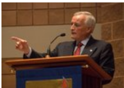
Some of the pictures from the December Food Drive, the Dickens presentation and the Christmas hamper effort

From the top left, we have the frontispiece from the first edition of Dickens' work, dated 1843; our poster for the Dickens concert; proof that not everyone gets to work indoors (someone has